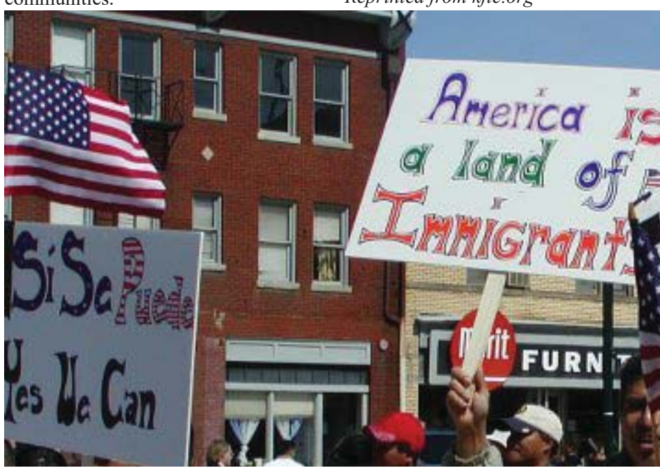
KFTC hosts a pro-immigration rally near the Fayette County courthouse.